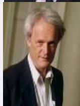
Richard Peto Co-Principal Investigator